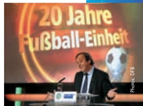
Michel Platini offers his best wishes and shares his memories of German football's reunification.