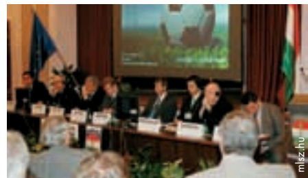
Determined to stamp out hooliganism