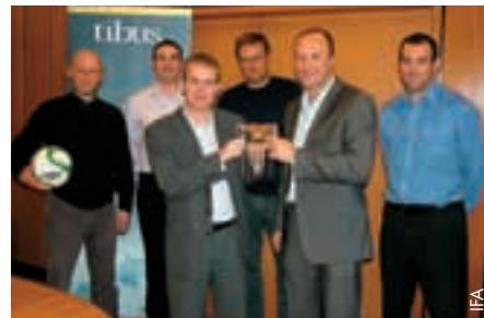
A much-appreciated award