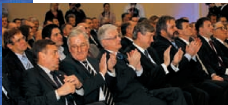
A very distinguished audience

The first Friday in December marked a very special occasion in Slovenian football: 90 years since the first governing body was set up on Slovenian soil. The predecessor of the Football Association of Slovenia was established in April 1920 and, in one form or another, has been managing football throughout the country ever since.