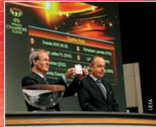
Quarter-final draw in Nyon

The first legs will be played on 9 and 10 April, with the return legs a week later on 16th and 17th. The final is being staged in London on 26 May. ●