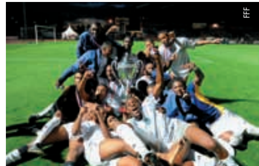
Martinique won the Coupe de l'Outre-mer.