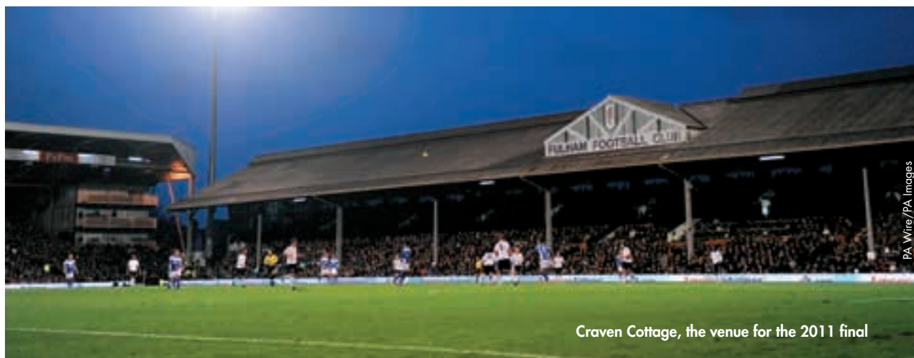
Craven Cottage, the venue for the 2011 final