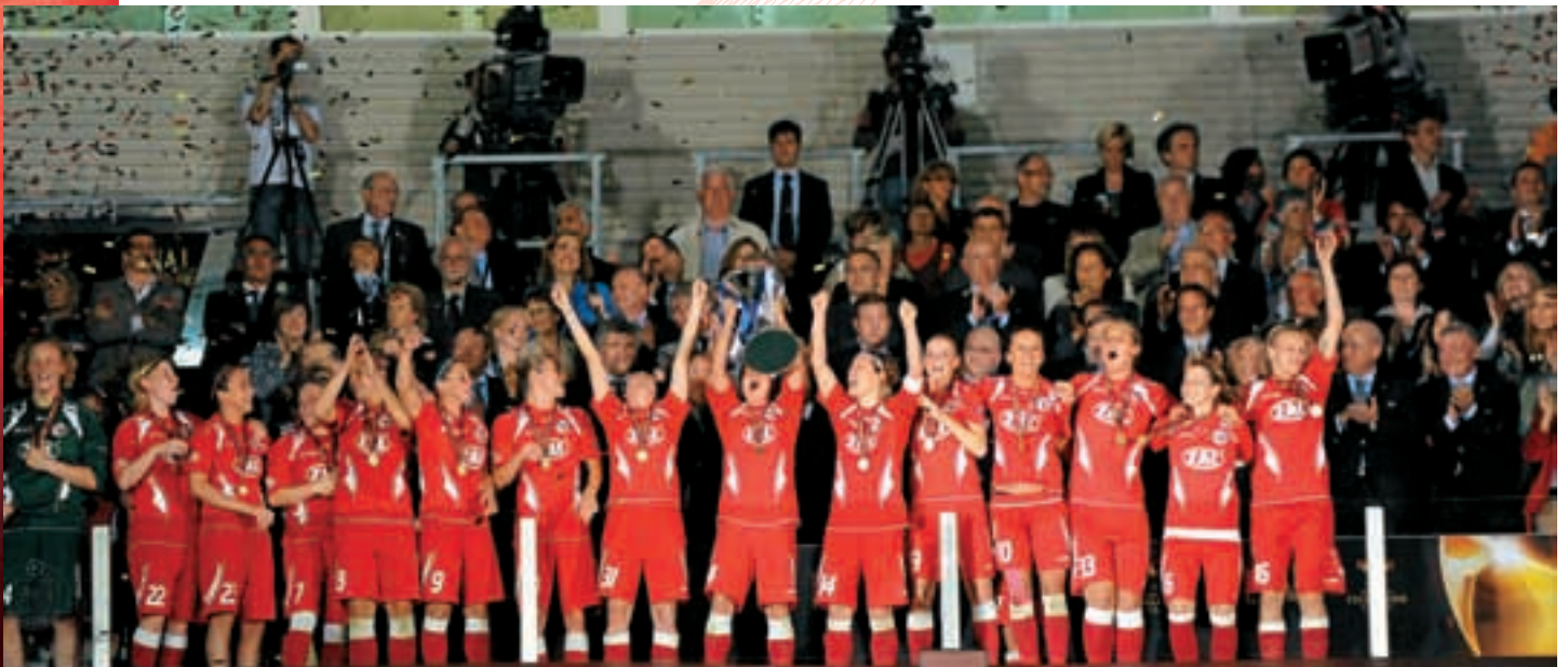
1. FFC Turbine Potsdam won the first Women's Champions League final, which was held in Madrid in the same week as the men's final.

Before moving onto the financial aspects of the competition, let us take a look first at its sporting side. In principle, each association is represented by one team, although the top eight in the rankings are entitled to two places (one in the round of 32 and the other in the qualifying round for the seasons 2009/10 and 2010/11; as from the 2011/12 edition, both clubs from the top eight will start in the round of 32). The qualifiers take place in