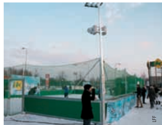
Festive winter football with a beach soccer atmosphere