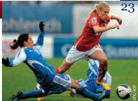
National team captain Lara Dickenmann, one of the protagonists in the Swiss women's football boom

The experience the players are gaining in lots of tough matches to build on their solid initial training in Switzerland is having a positive influence and will doubtless result in plenty more success for what is still a very young national team (the average age is under 23). There are also more talented female players coming up through the Credit Suisse Football Academy set up in 2004 and the U19 and U17 national teams. The U19s made it through the first qualifying round of their European Championship with three wins against Poland, Kazakhstan and the former Yugoslav Republic of Macedonia and are now preparing to meet the Czech Republic, Sweden and Ukraine in the second qualifying round in