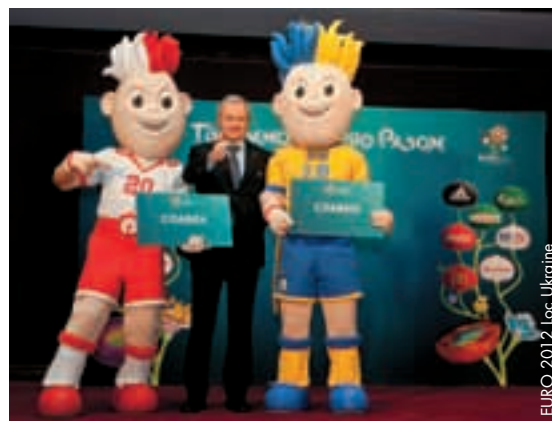
EURO 2012 Loc Ukraine

Since being unveiled, the twins' feet have hardly touched the ground. On 17 November they attended Poland's friendly international against Ivory Coast at the Miejski Stadium in Poznan, as well as Ukraine's game against Switzerland in Geneva. The president of the Polish Football Federation, Grzegorz Lato, was on hand to witness their international debut and said: "I like the mascots. They do their job well, promoting the two host nations and the finals."