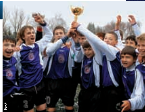
The eastern team, winners of the Viitorul tournament