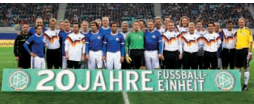
The gala match between former World Champions and ex-East German internationals