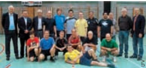
The Liechtenstein referees' seminar

On 6 November, the Liechtenstein Football Association (LFV) celebrated its first ever Referee Day. To mark the occasion, all the referees affiliated to the principality's seven clubs were invited to a one-day seminar to work on their theoretical and practical skills with their col-