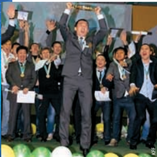
First-time domestic champions FC Kostanay Tobol