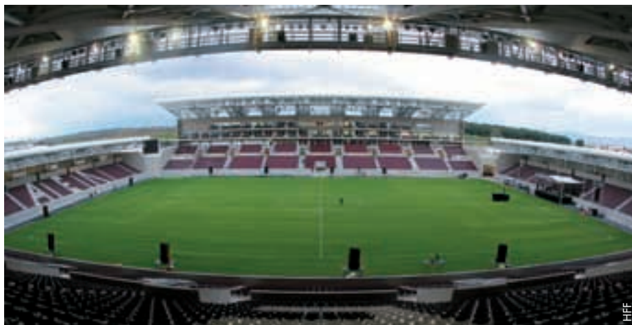
The new stadium in Larissa