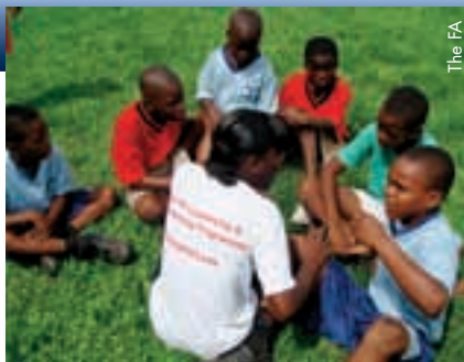
A young leader from Trinidad puts into practice what she has learned from The FA.