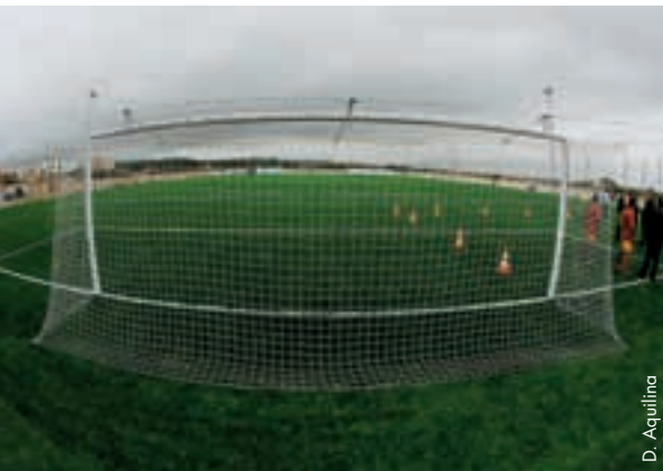
FC Siggiewi's new pitch

The construction of new football facilities and the renovation of existing ones has been a priority of the Malta Football Association (MFA) for some time now. This work is being carried out in conjunction with UEFA's HatTrick programme, which is aimed at consolidating the football infrastructure of all member associations, including Malta.