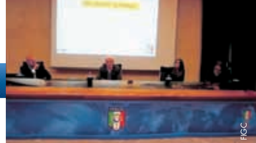
Arrigo Sacchi, an advocate of 'global football'

His presentation was illustrated with video clips, including one focusing on players born in 1990 who might be contenders for the Under-21 team under new coach Ciro Ferrara . He was disappointed to note that, on the last match day, only five of these players had been fielded in Serie B matches, whereas abroad, such players were playing first-team football. In the spirit of cooperation on which these meetings are based, Sacchi reminded the coaches that their task should be to train the players rather than win matches and to work for the youngsters rather than for themselves.