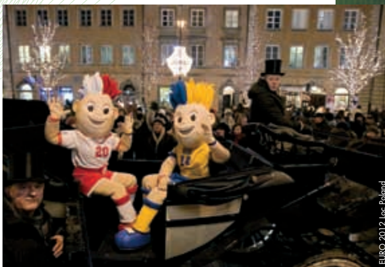
Slavek and Slavko meet the public.