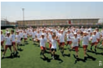
Football for all, throughout the country

Ersun Yanal, the TFF's director of football, said: "With grassroots football for all activities, we aim to diversify football and increase the number of people who play the game. We