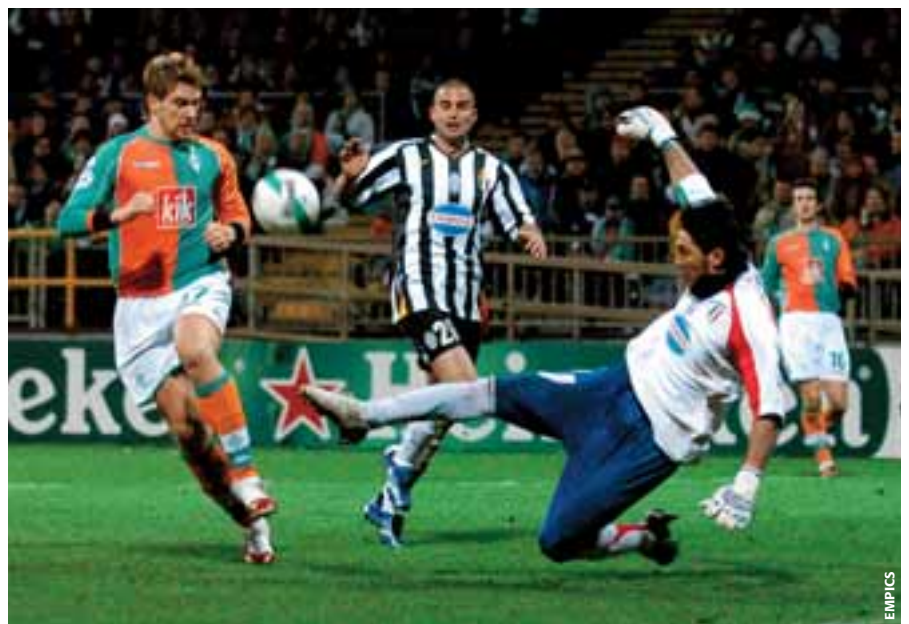
One versus one situations in the penalty box are key moments for the referee.

The technicians stressed that the moments following the switch of ball possession from one team to the other are key components within the structure of the modern game. Situations where the team winning the ball tries to counter-attack quickly and effectively while the team losing possession aims immediately to break up that counter-attack generate a series of challenges for the referee and his assistants. For them, fast transitions demand equally rapid responses in terms of keeping abreast of play in order to judge situations and punishments as efficiently as possible.