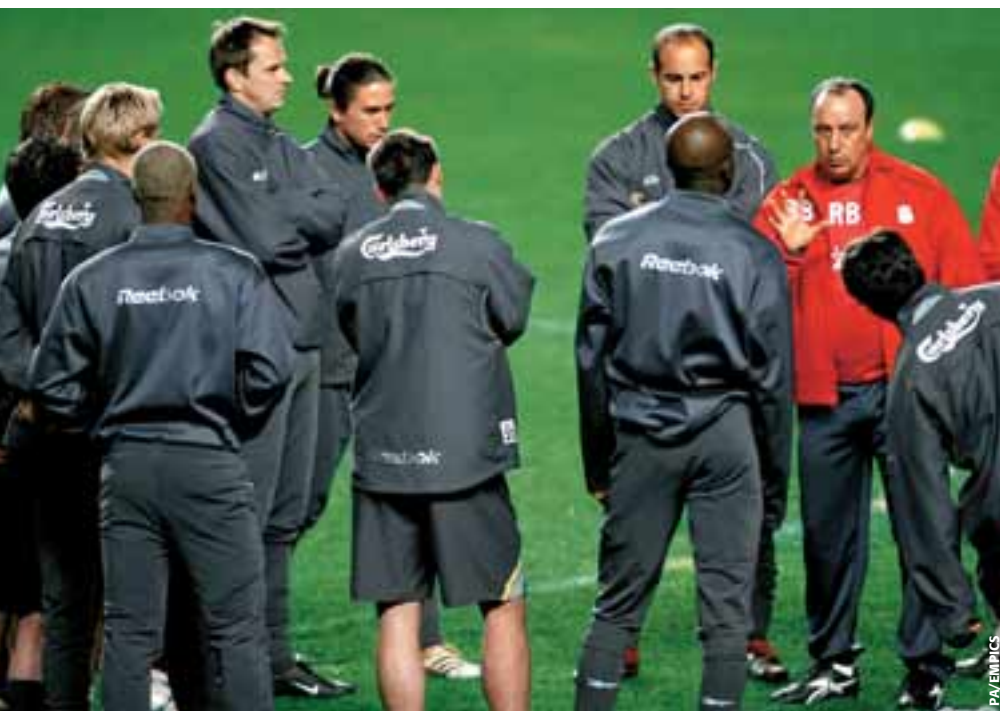
Rafael Benitez surrounded by his Liverpool players.

The advantages of an extranet are that it provides a simple one-stop paperless reference for the time-challenged coach. The extranet has immensely more capacity than a paper archive: it can be accessed any time and anywhere the coach has