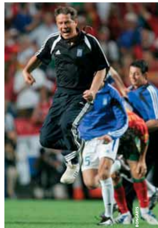
A jubilant Otto Rehhagel after Greece's victory over Portugal in the EURO 2004 final.

for the promotion, protection and advancement of the game – players, coaches, referees, clubs, administrators and fans. The quality depends on the depth. It is not enough to have a few elite teams dominating the scene. We need variety and competitive intensity. Just think of Valencia's sterling efforts in 2000 and 2001 – twice the UEFA Champions League bridesmaid, never the bride! Or 'the added' value which Arsène Wenger and Arsenal have given to the UEFA Champions League without actually winning it (so far). Yes, everything in football stems from its competitions. For the last 50 years, UEFA's top club and national team championships have created a showcase for the best in European football, and it is vital for the future health of the game on our continent that we recognise, defend and develop UEFA's flagship competitions – the UEFA Champions League and the European Championship. They are, after all, our core business and our priceless heritage.