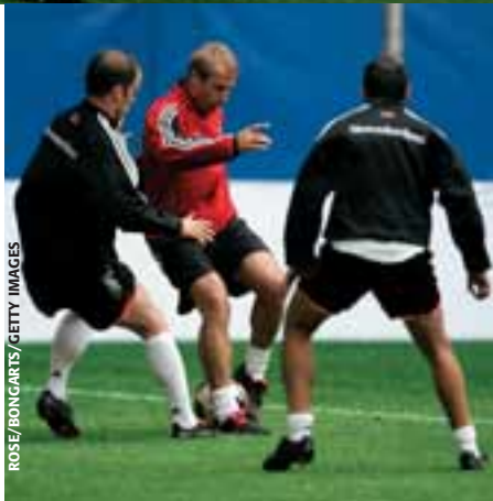
Still fit enough to take part in training.

is vital – players must be alert and in peak physical condition. Even in training, this awareness must be developed.