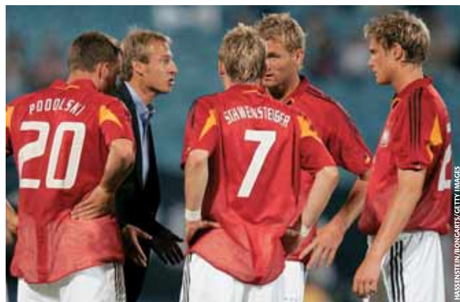
Jürgen Klinsmann gives instructions to his players.

Based on our experience of the Confederations Cup, we see that Brazil and Argentina are ahead in terms of quality and how to deal with certain moments in the game. Other big teams like England, France and Italy are strong and capable of making a difference. We believe that Ukraine could be a surprise because Oleg Blokhin has developed them very well over recent years. Pre-tournament, it looks like Brazil and Argentina are up to the challenge, but we will see.